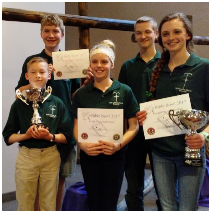
After Bible Bowl