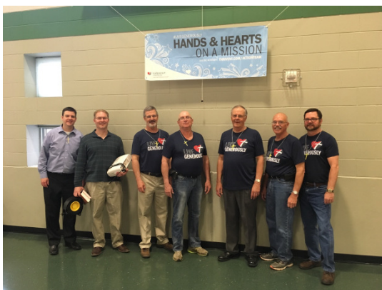
Hong Kong Pancake Breakfast Men's Club work crew.