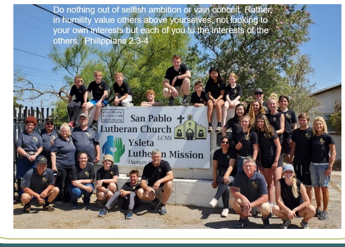
Equipping God's People for Life

Ysleta Lutheran Mission has many churches they support in Mexico and Texas